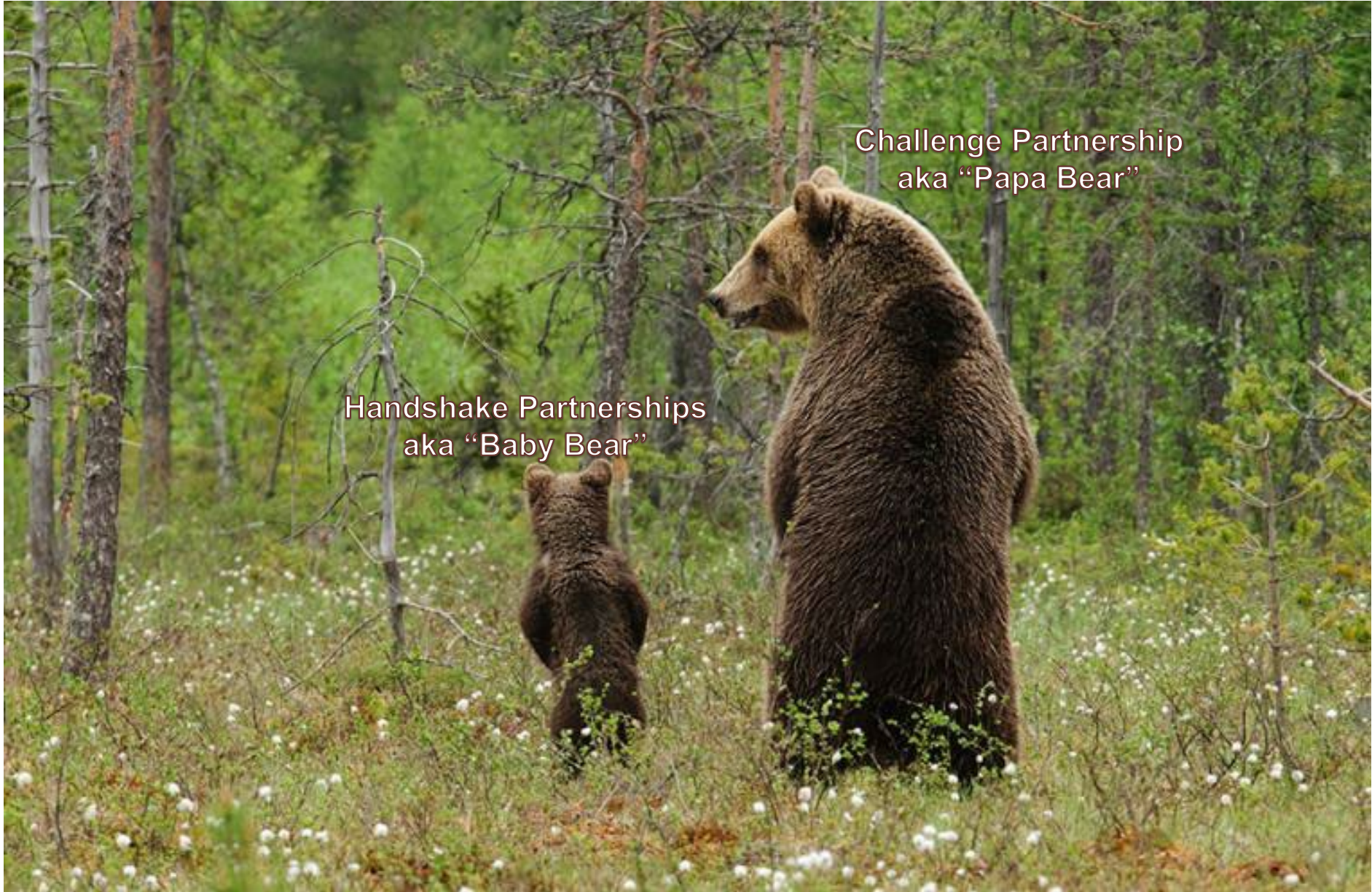
Challenge Partnership aka "Papa Bear"