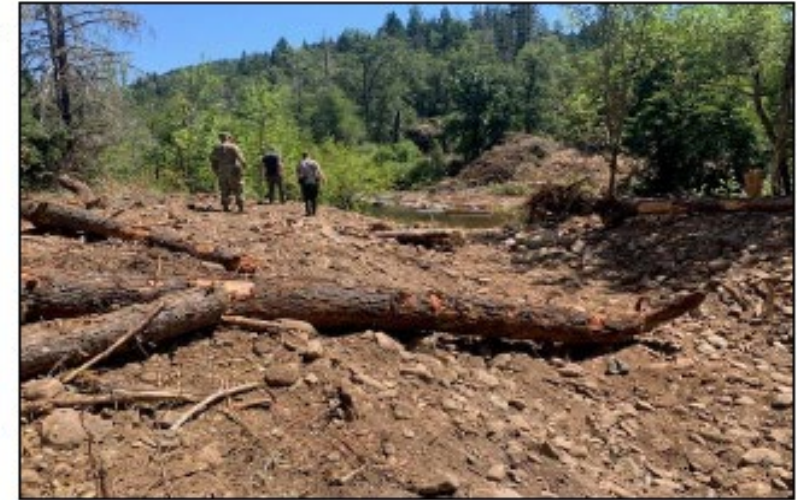
Side channel excavation with large woody debris. Logs donated by BLM and Hancock Timber- salvage from 2018 Miles wildfire that burnt 200+ ac in Elk Creek.

Community Impact: Interpretive signage was created to convey the importance of this ecosystem restoration project. Use of non-marketable timber salvaged from the 2018 Miles Wildfire that impacted over 52,000 ac in the local community.